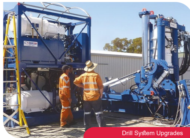
Drill System Upgrades